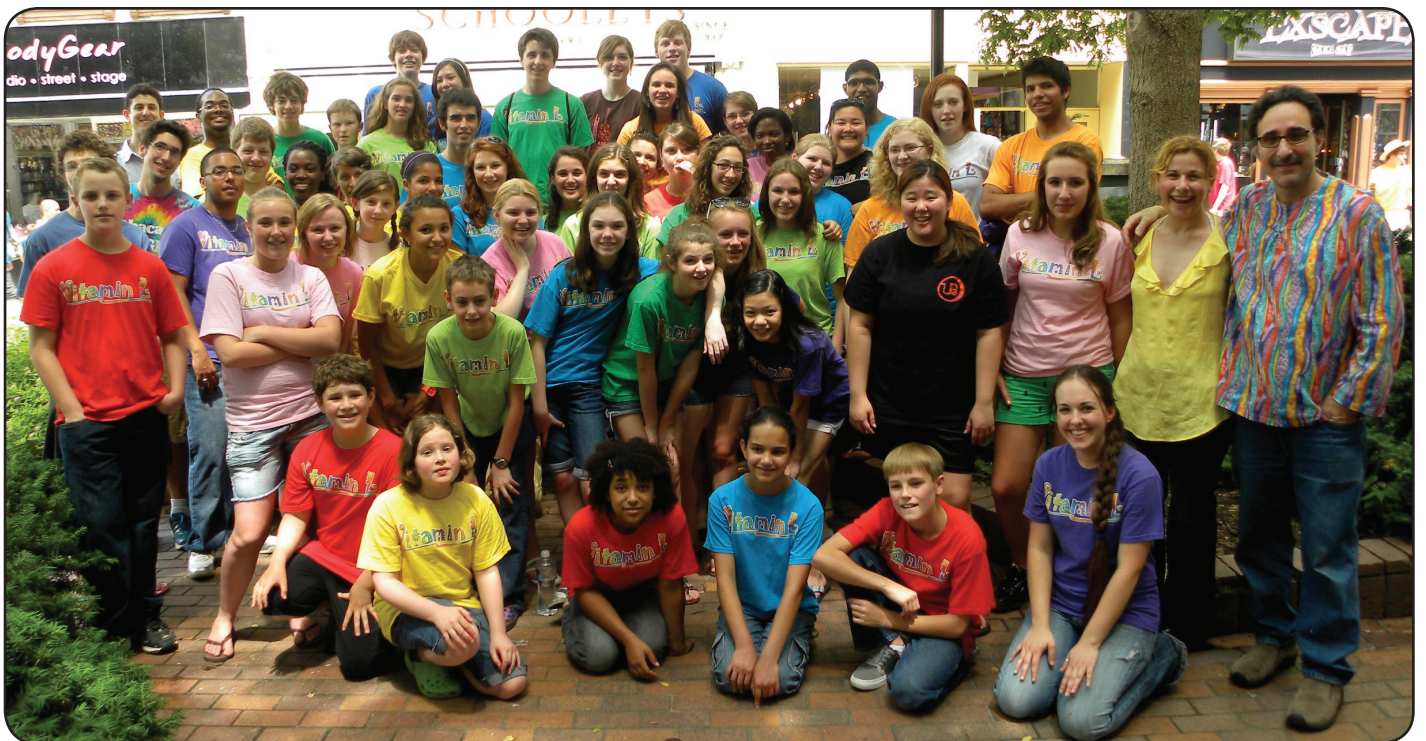
Vitamin L Chorus with some alumni guest singers at the 2010 Ithaca Festival